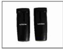
AZ PC 10 Photocell