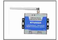
AZ GSM 30 GSM Module