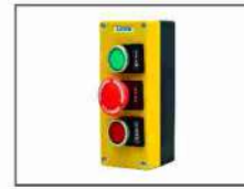
AZ PB 16 A Push Button