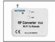
AZ RF WIFI 31 A Wifi Module