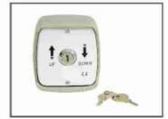
AZ KS 15 Key Switch