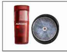
AZ RFPC 43 Reflector Photocell