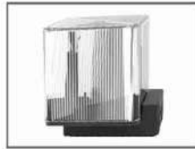
AZ FL 19 Flash Lamp